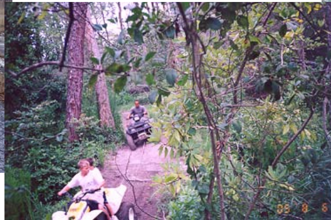
Trespassing and Injury